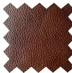
WALNUT High Grade Thick Leather/Match